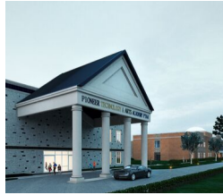
Greenville May 2018 completion Basketball Courts Completion Swimming Pool