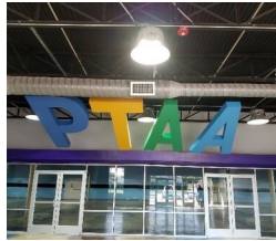
Mesquite Campus Construction Complete

E. info@ptaaschool.org www.ptaaschool.org