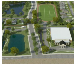
New Rockwall County Fate Campus Construction begins April 2018 Opens Aug 2018