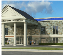
New Construction Mesquite 2018 Basketball Courts, Competition Swimming Pool